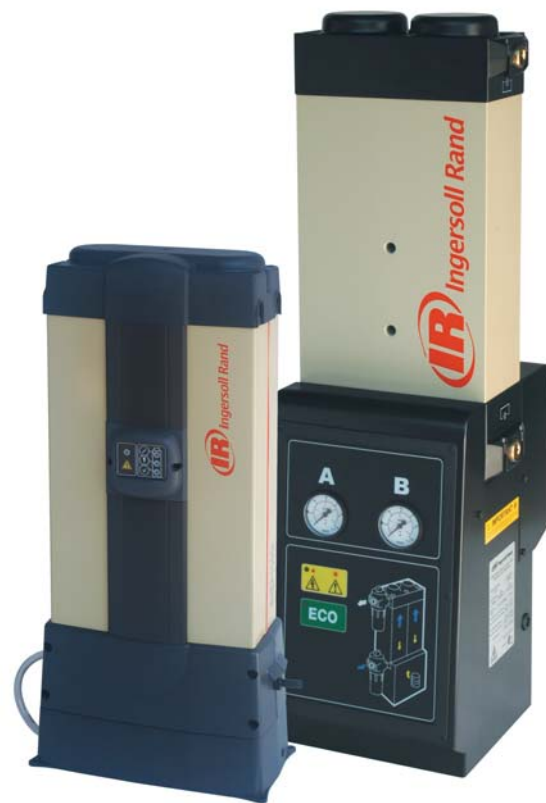
D51M to D341M Modular Dryers

Our dryers feature standard ISO Class 2 dewpoint performance, with optional ISO Class 1 to meet the most stringent requirements. This helps prevent corrosion and minimizes production disruptions or losses due to moisture or contamination. And easy on-site maintenance – less than 15 minutes after 12,000-hours of use – gets you back on line quickly.