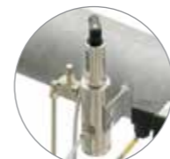
PDP sensor kit